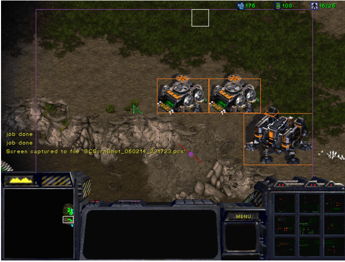
Fig. 1. Example of a wall found using the wall-building algorithm. Choke point is indicated with a red line and a purple circle.

In our approach we use a wall to seal off a choke point. A choke point is a location on the map (terrain) that connects two regions [5] (see also Figure 1). If a wall is built near this choke point, then the two regions of the choke point are separated (no longer reachable by ground units).